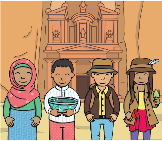
The Desert Dig