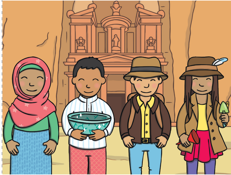
A 'Let's Write Together!' Book